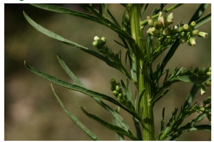
Horseweed stem leaves.