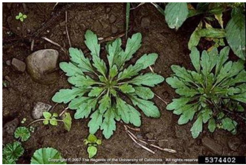
Horseweed rosette.