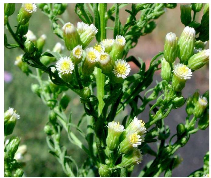
Horseweed flower heads.